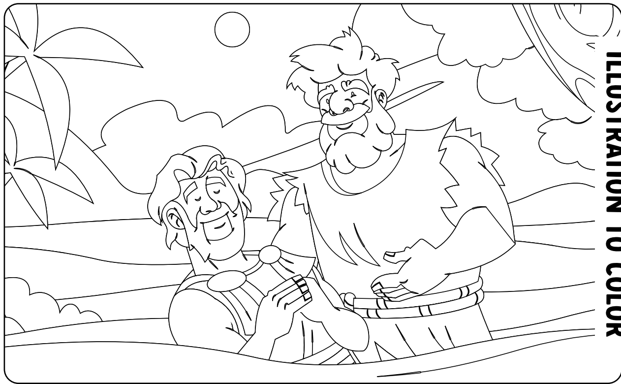
ILLUSTRATION TO COLOR

YOUNGER ELEMENTARY JESUS' BAPTISM AND TEMPTATION