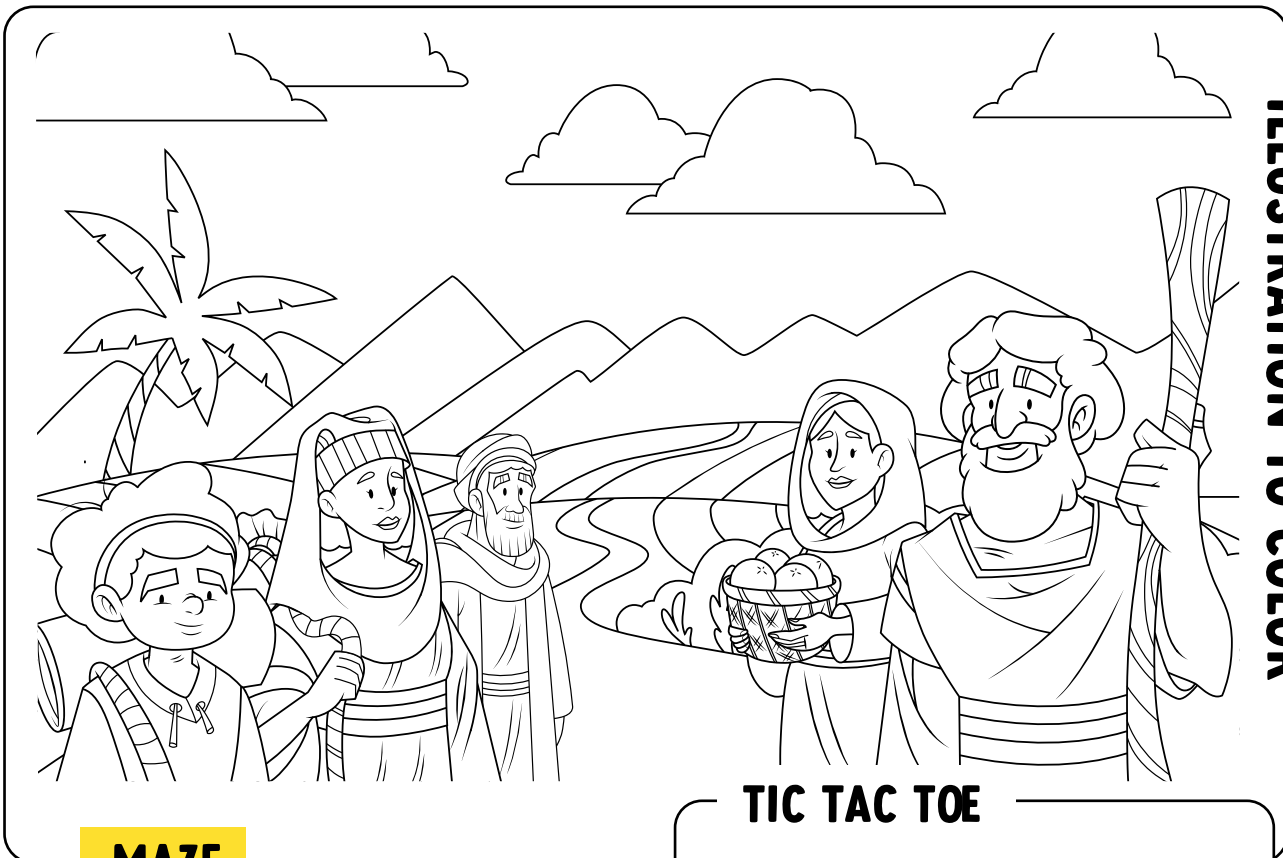
ILLUSTRATION TO COLOR

YOUNGER ELEMENTARY PSALMS OF THANKSGIVING